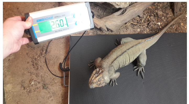
The scale is large, but can still measure this iguana accurately

Since 1972, Adam Equipment has designed and manufactured precision balances and scales for professionals worldwide.