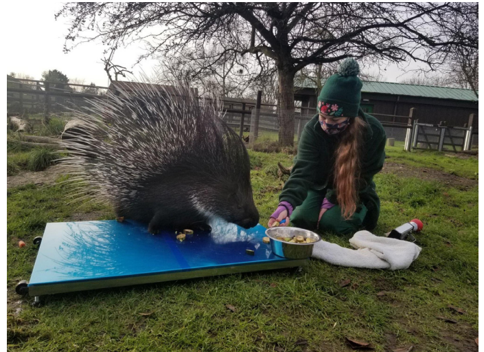
A porcupine is coaxed with treats

For more information on CPWplus, visit https://www.adamequipment.co.uk/cpwplus-weighing-scales .