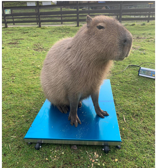
A capybara sits on the CPWplus to be weighed

The CPWplus 200 L offers a large 900x600mm platform that can accommodate even large animals, and a capacity of 200kg. Its readability of 0.05kg works well enough to weigh smaller animals such as badgers or hedgehogs as well. The scale features a handle and wheels for easy transportation; it's often taken to the various habitats where the animals live. It's easier on the animals, as they can be weighed in a familiar environment and are not stressed by the move.