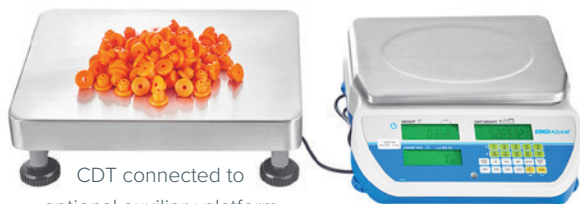
CDT connected to optional auxiliary platform

For quick, accurate bulk counting — whether it's stock-taking or order picking — the Cruiser CDT allows users to connect an auxiliary platform. Easily connect the second weighing platform to the Cruiser and control both using the CDT's full numeric keypad. The optional platforms can handle bulk parts with its large capacity while the CDT provides superior accuracy for a better counting solution. The scale automatically refines the piece weight for greater accuracy. The included RS-232 and an optional USB interfaces provides quick data communication with printers and computers, for intuitive integration into secondary systems. Users can store and recall up to 100 items in the CDT's memory for management of frequently used parts. The internal rechargeable battery lets the scale to be used anywhere, even if power is not available.